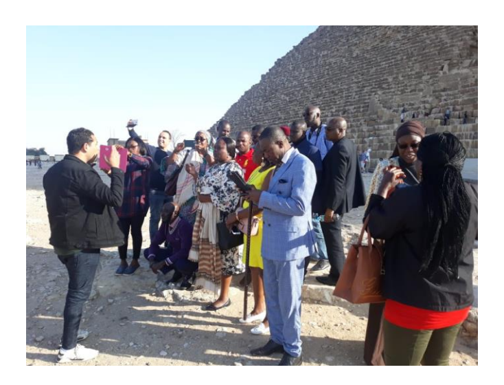
Participants in the guided tours of the world-famous Egyptian pyramids

Also, during these training, the participants have the opportunity to admire the beauty of Egypt including the visit of the famous Egyptian tourist sites such as the Egyptian pyramids, the Nile etc