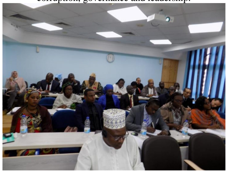
One of trainees during the course

The training will focus on the fight against corruption, which broadly includes subjects on corruption, governance and leadership.